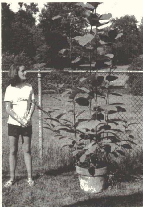
They grow! Yearling plants of M. denudata × M. sargentiana robusta nine feet tall.