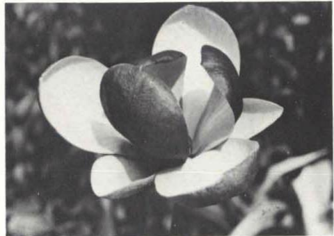
M. 'Joe McDaniel' ( M. × veitchii × M. × soulangiana 'Rustica Rubra') has red-violet blooms that are the darkest red of the Gresham hybrids at Gloster Arboretum. Its tall, tulip shaped, deep purple opening buds become bowl-shaped, broad tepaled flowers.