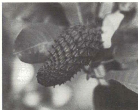
M. x 'Wieseneri' seedpod (Hill)

described by Treseder having borne seed even once, let alone regularly. On my tree there was but one fruit, narrowly saved from destruction, which has produced a number of extremely vigorous seedlings. The tallest of these plants is now a single-stemmed affair standing twelve feet high. So far from Treseder's 'small bushy tree with long gangling branches arising from a short basal trunk,' which exactly describes my plant of M. x 'Wieseneri' , it is a most vigorous strongly apical-dominant affair which clearly intends to grow into a big tree much as M. hypoleuca does. The leaves seem to my inexpert eye intermediate between M. x 'Wieseneri' and M. hypoleuca , which in this garden grows close to M. x 'Wieseneri' and flowers at the same time. I do not therefore doubt that my seed pod is the product of M. hypoleuca pollen on M. x 'Wieseneri' .