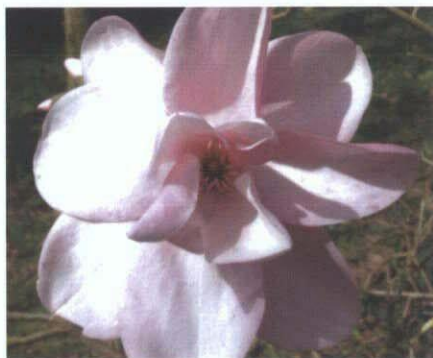
Magnolia ‘Delia Williams’

This tree (originating from seed) was first planted in the gardens of Caerhays Castle in 1964. Today at 46 years of age, the tree is 98 ft. (30 m) in height and 55 ft. (17 m) in width. The tree flowered for the first time in 1971. The flowers are described as exceptionally large in size, opening a clear pink, inside and out, the inside tepals gradually fading to white. The flower habit is more long-lasting in bloom than typical Magnolia sargentiana var. robusta . When at peak bloom it is described as one the most spectacular trees in the garden’s magnolia collection. The plant has a strong central leader with good vigor and has prospered despite growing in poor rocky soil. This magnolia is believed to be hardy to USDA Zone 8 and is available from commercial sources. The tree was named in honor of Mr. Williams’ mother, Delia Williams. Registered by Mr. C.H. Williams.