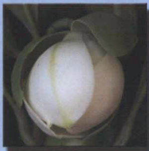
Magnolia coco Coconut Magnolia