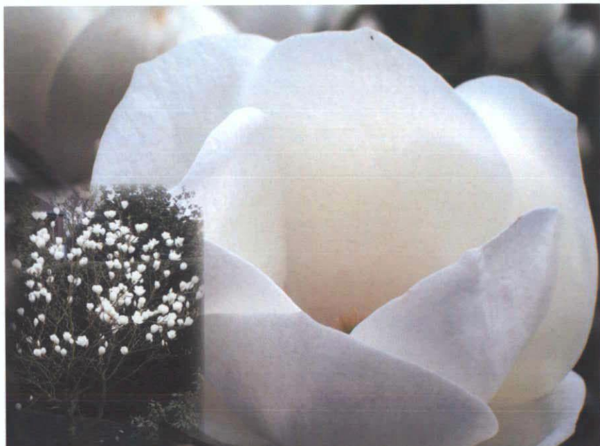
Magnolia × soulangeana 'Joris'

This tree occurred as a spontaneous seedling at Heythuysen. At an estimated 20 years of age, it stands 10 ft. (3 m) in height and 6 ft. (2 m) in width. The flowers appear about two weeks earlier than typical Magnolia × soulangeana . The saucer-shaped flowers are 3 to 4 in. (8 to 10 cm) in diameter and are described as exceptionally frost tolerant. The tree is currently in nursery production. Registered by Mr. Theo Kuijpers.