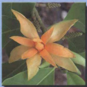
Magnolia (Michelia) champaca Joy Perfume tree