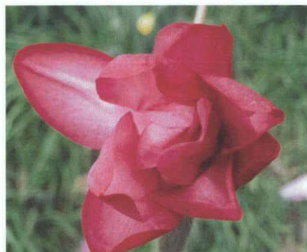
Magnolia ‘F.J. Williams’