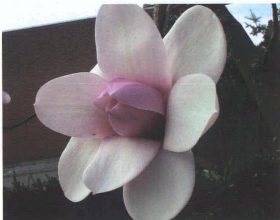
Magnolia campbellii 'Veerle'