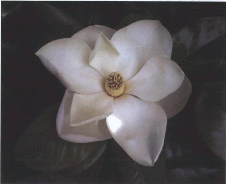
Magnolia grandiflora 'Eveline'

The tree was grown at Heythuysen from seed provided by the Magnolia Society seed exchange in the early 1980s. The tree is described as broad and conical with an approximate height of 33 ft. (10 m) and a width of 20 ft. (6 m). The tree has dense foliage that is resistant to wind, snow, and severe frost while remaining evergreen in USDA Zone 6. The glossy leaves are 10 to 12 in. (25 to 30 cm) long with undulated margins with the underside having a light indumentum. The tree first flowered in the late 1980s with a profusion of creamy white flowers approximately 10 in. (25 cm) wide. The tree is currently in nursery production. Registered by Mr. Theo Kuijpers.