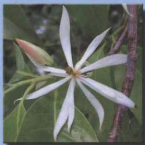
Magnolia (Michelia) x Alba White Champak